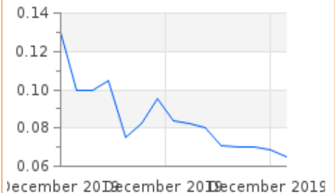
1 Year Share Price Graph

dataglobal's software portfolio is the future-proof solution for the automated, company-wide classification of data such as its comprehensive archiving.