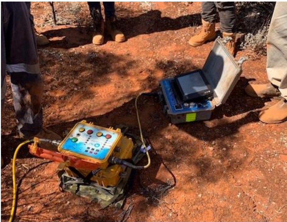
Area D low frequency MLTEM survey

"The highlight activity has been the completion of the low frequency EM (electromagnetic) survey at Area D. This survey was designed to optimise the modelling of the D5 and other surrounding conductors which will be the focus of the upcoming diamond drilling programme.